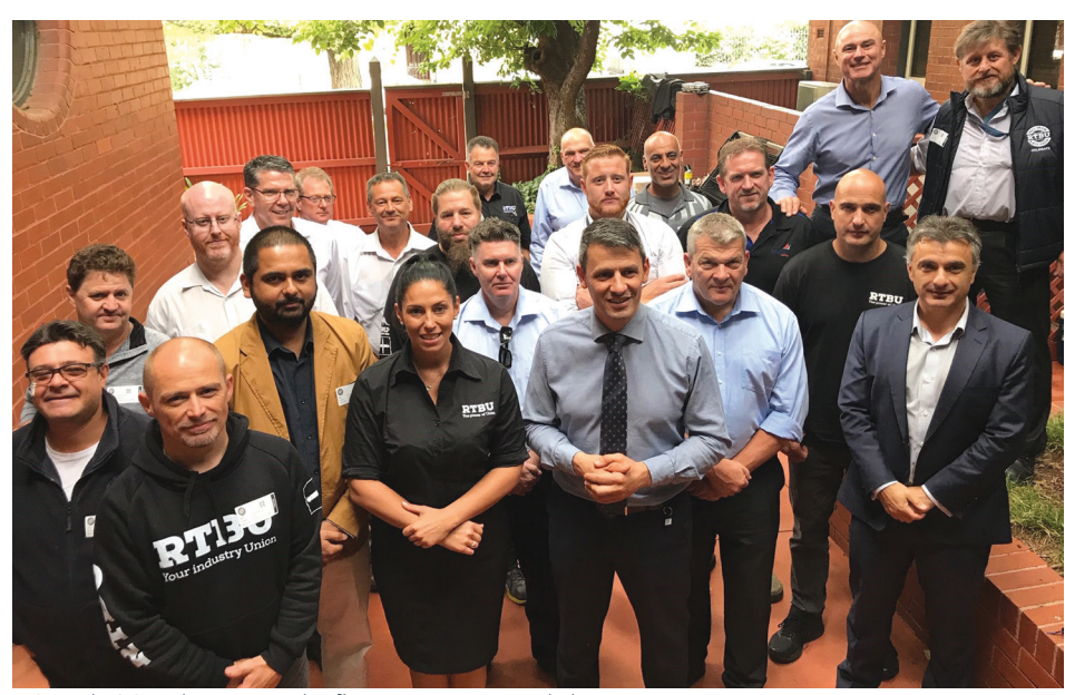
AO and PSO Delegates at the first RTBU / TPA workshop

The workshops have been successful so far with many attendees from both the RTBU