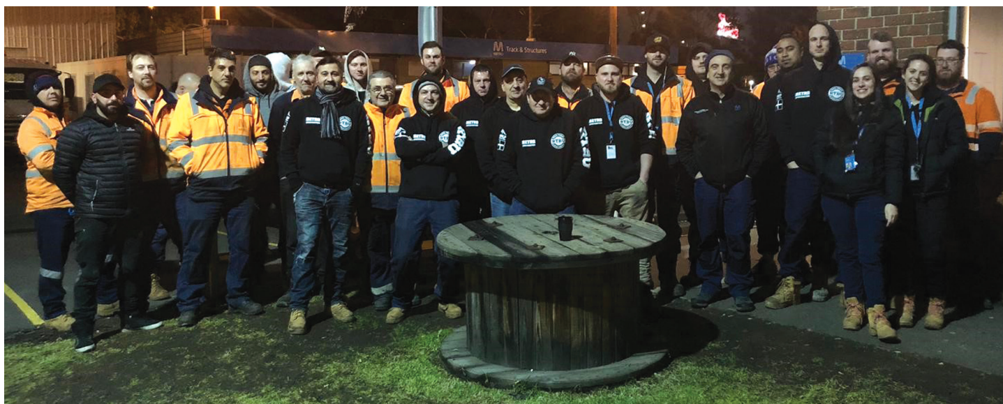
Metro Infrastructure Members at E-Gate